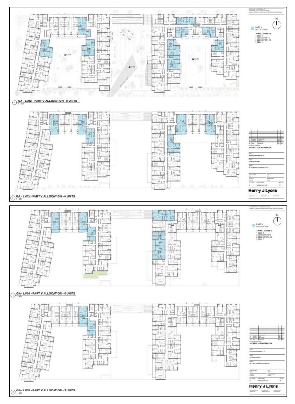
Fig 1: Part V Layout

Appendix 1 provides a summary of the cost estimates for each unit type. The costs are estimated based on industry cost standards. Final transfer costs will be agreed with Cork County Council, following any grant of planning permission, based on a measured Bill of Quantities for the site.